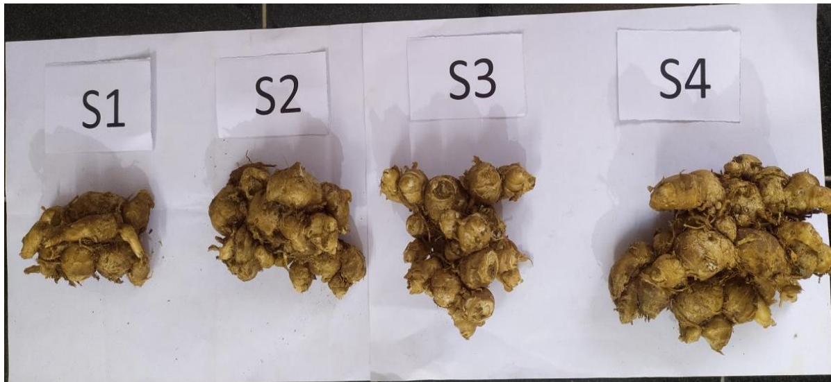
Plate 1. Growth of rhizome under varying spacing treatments

The oil yield per hectare was also affected by planting date and spacing. The April 15 planting date resulted in the highest oil yield per hectare (82.62 kg/ha), indicating that this date allowed for optimal growth and development of the plants. Similarly, the closest spacing (20 cm x 20 cm) resulted in the highest oil yield per hectare.